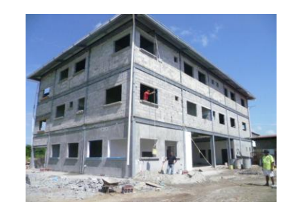
Exterior completion Feb. 2011

Currently, we are finishing the interior and hope to complete it within 5-8 months if funds are sufficient.