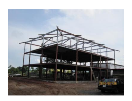
Structure framing finished Aug, 2010